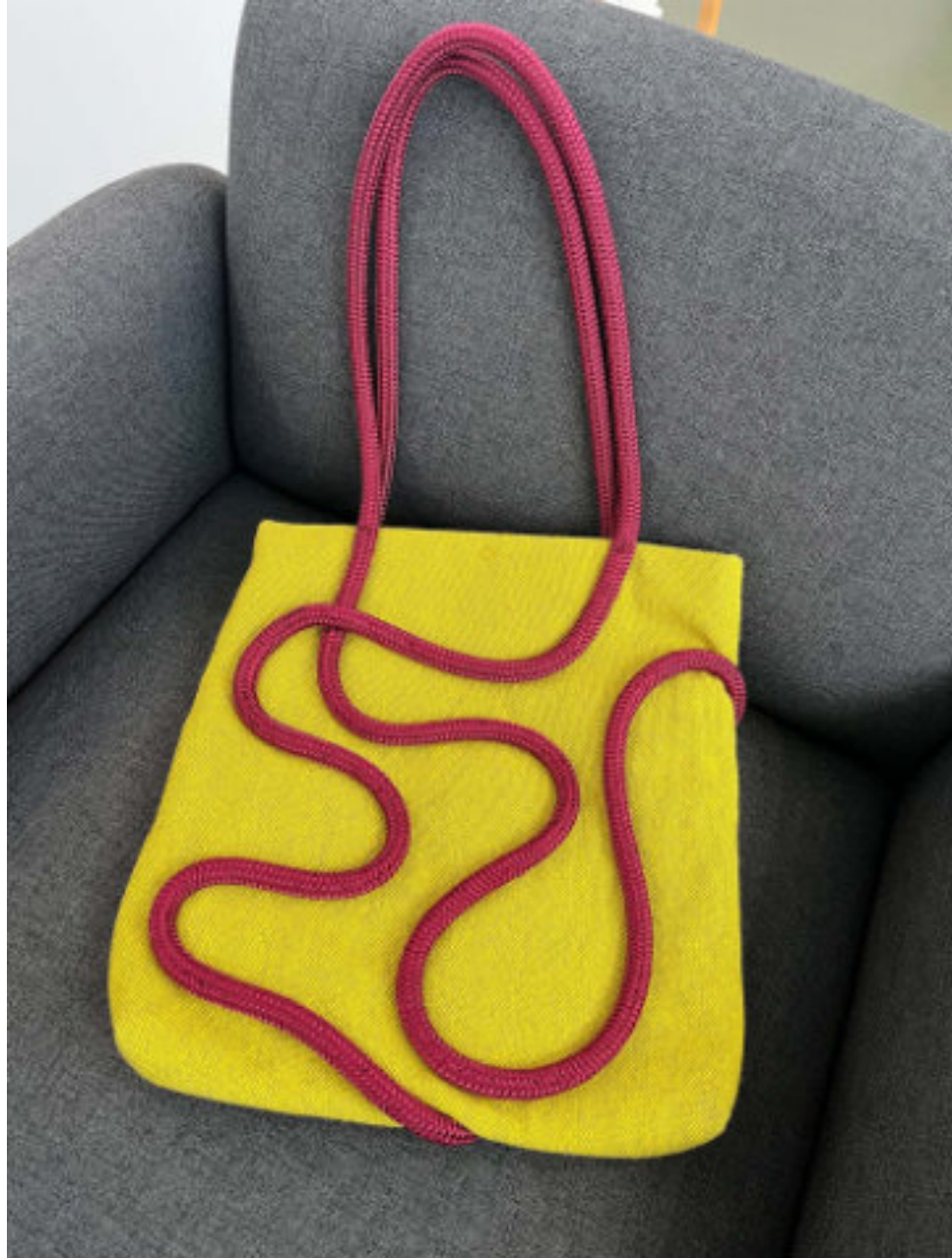
Rope bag 2022 Fabric, rope $450