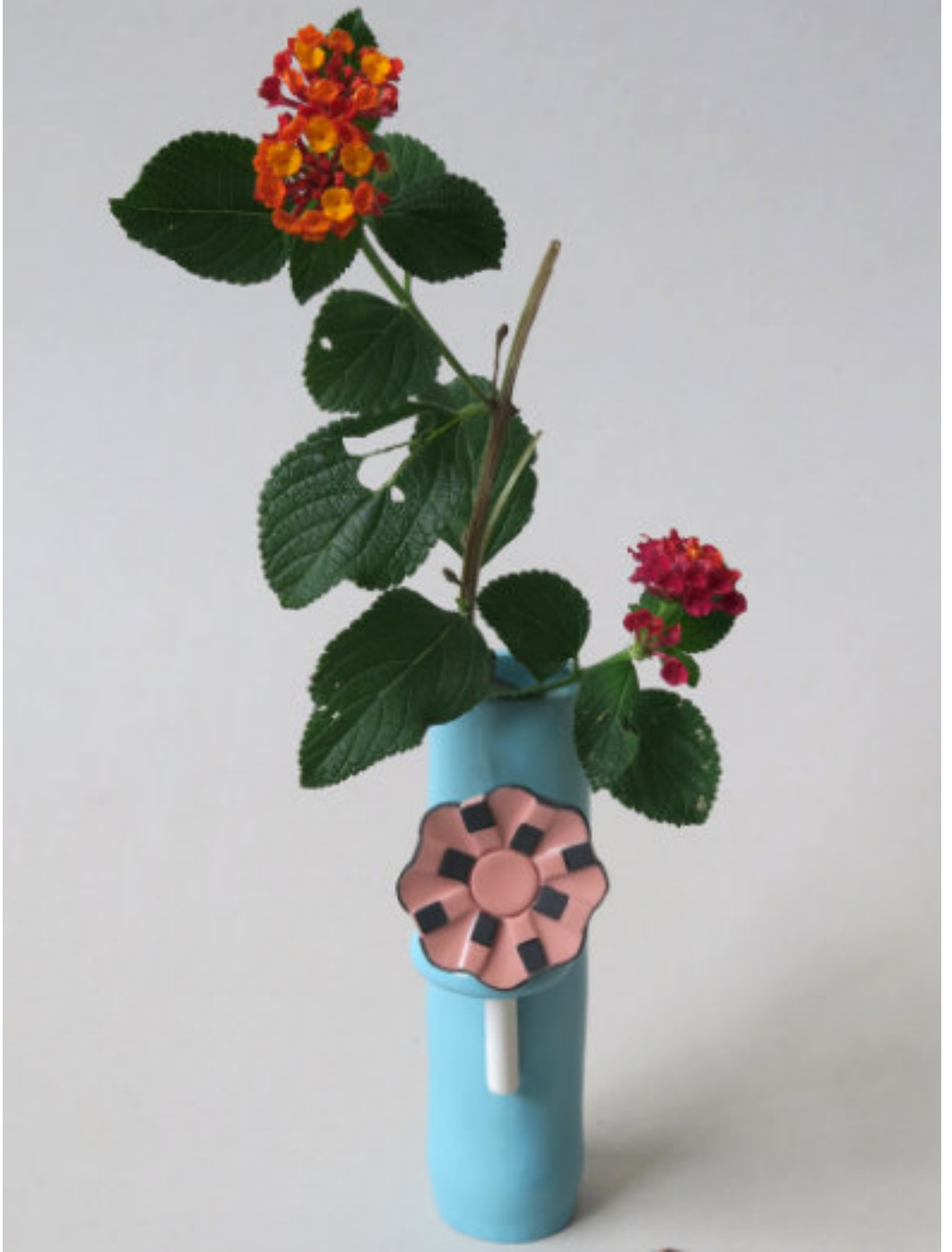
Holding you close 1 Vase, 2021 Porcelain, glaze $1300