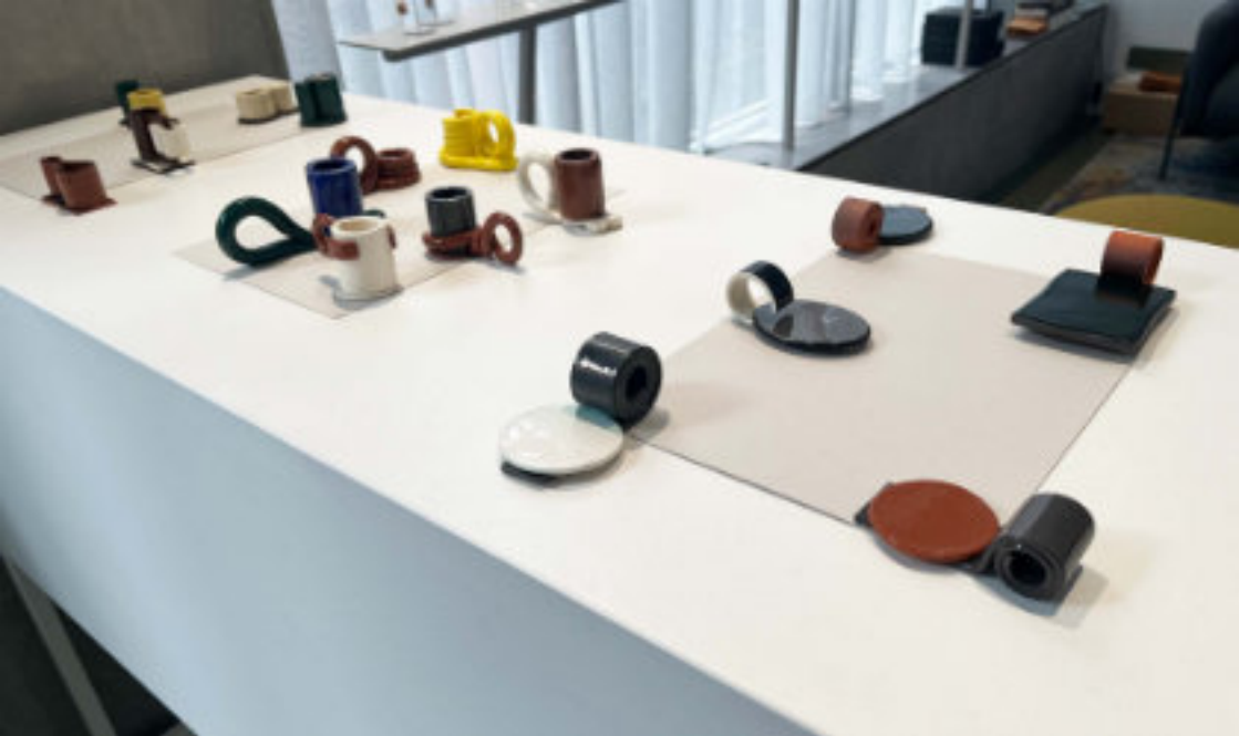
Candle holders 2022 Earthenware $360 each