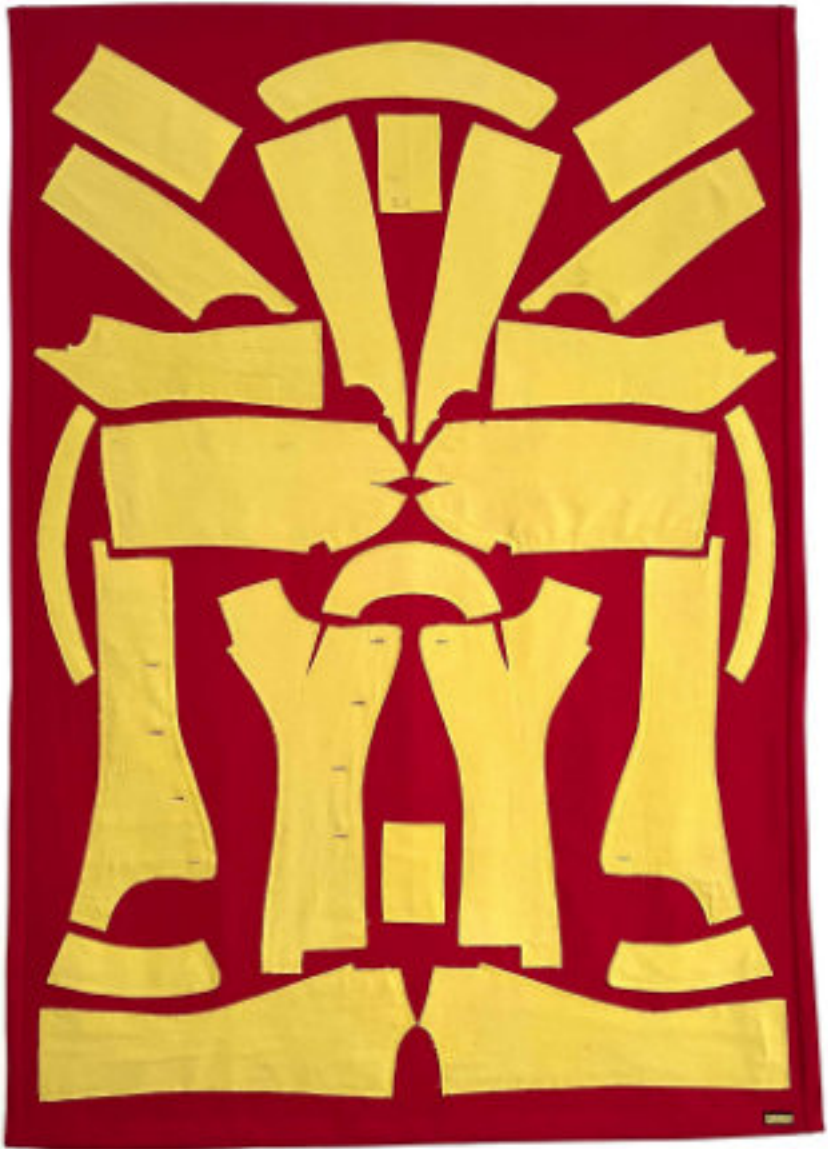
Review 2022 1990s wool jacket, New Zealand made upholstery fabric 200 x 140cm $5500