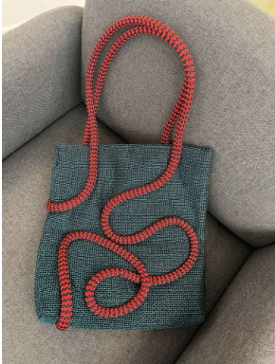
Rope bag 2022 Fabric, rope $450