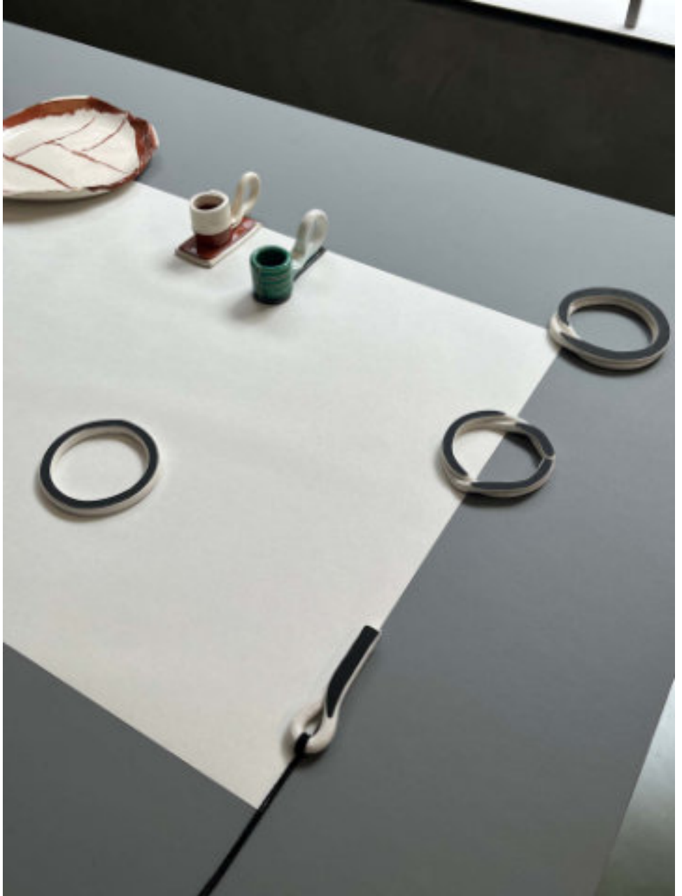
Earthenware plates, candleholders Porcelain pendants, bracelets 2021-22 $360 - $730