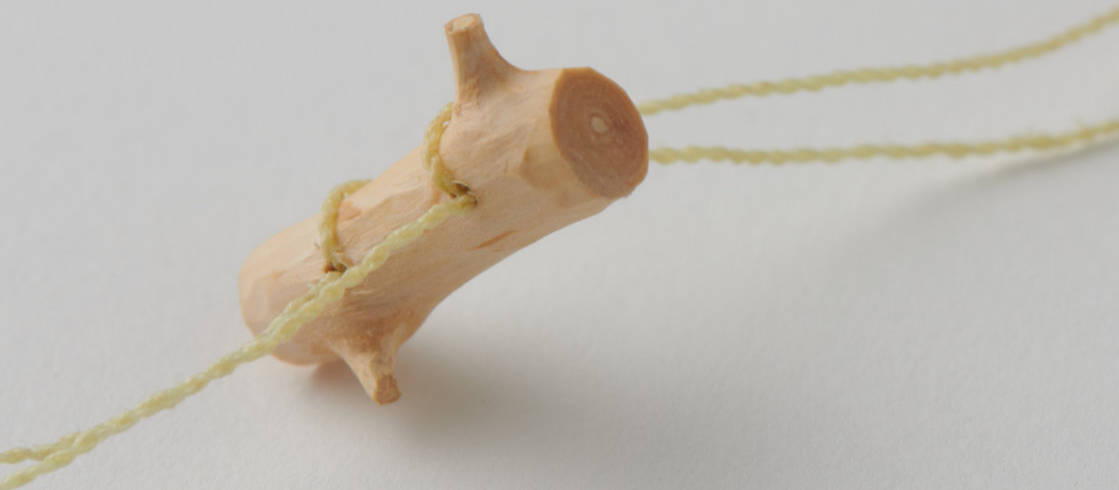
Paddock II (detail) 2022 willow, found bailing twine