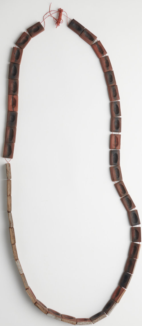
Cast back I 2022 River red gum fence post, found bailing twine SOLD