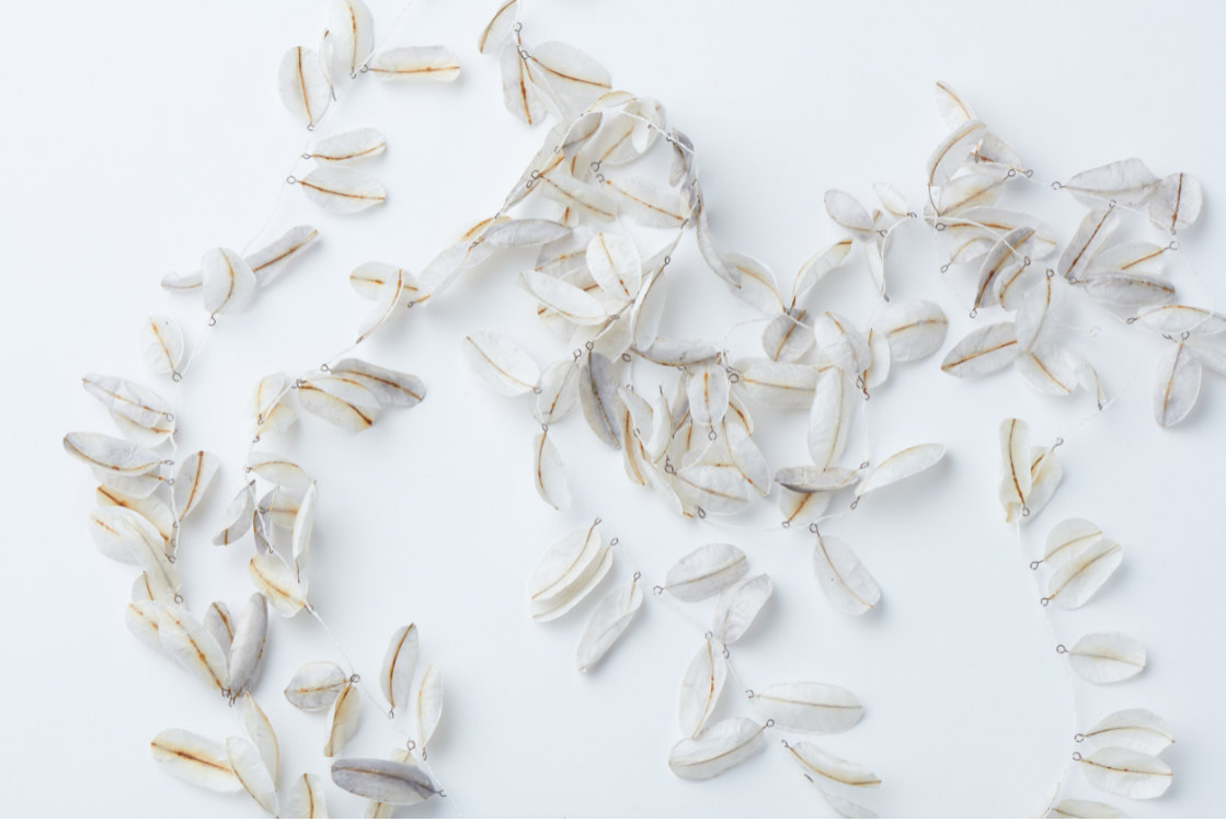
Cast back II (detail) 2022 paper, iron, found silage netting