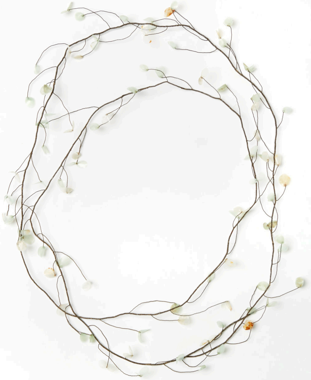
Tether II 2021 found tree guard, iron SOLD