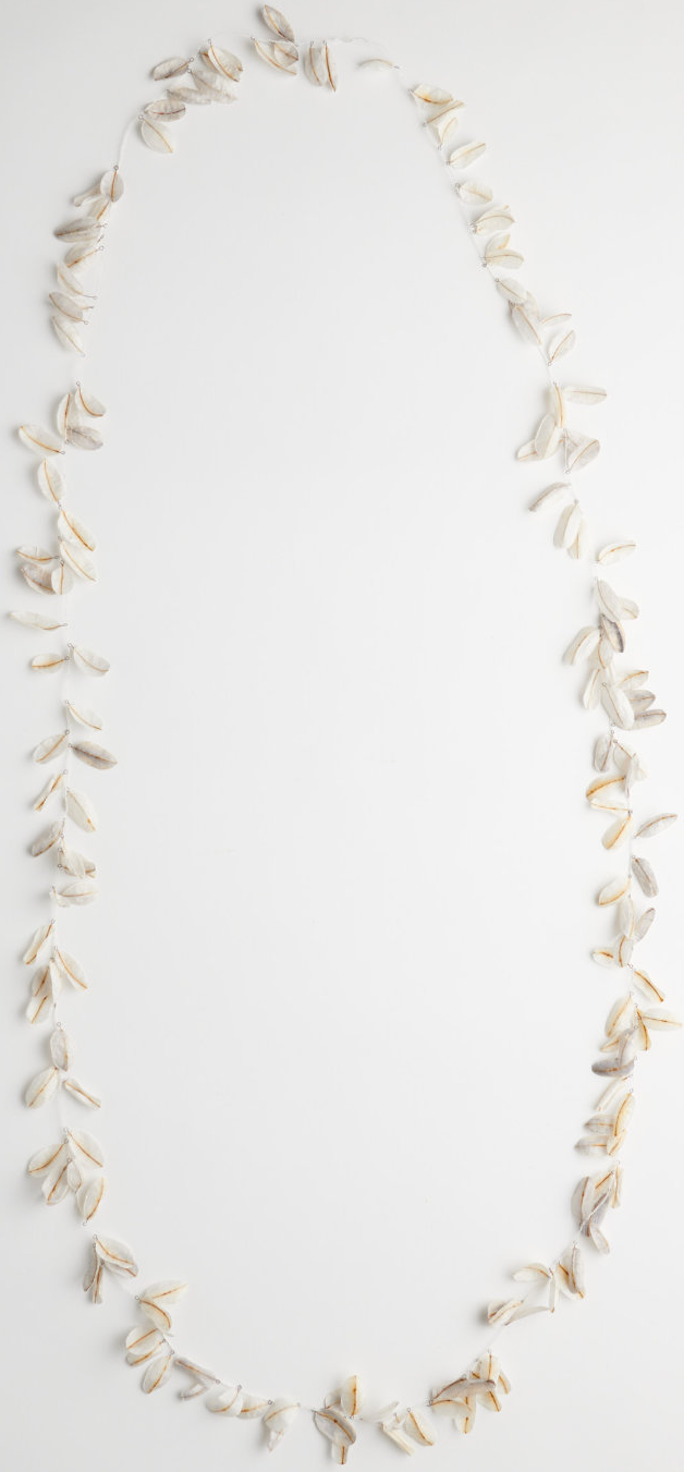
Cast back II 2022 paper, iron, found silage netting SOLD