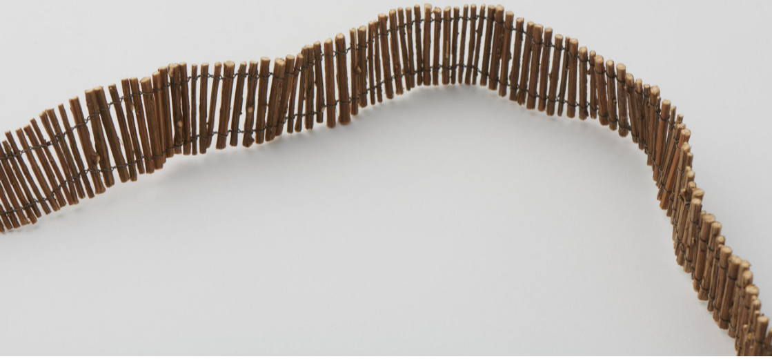
Paddock I 2022 English broom, iron SOLD