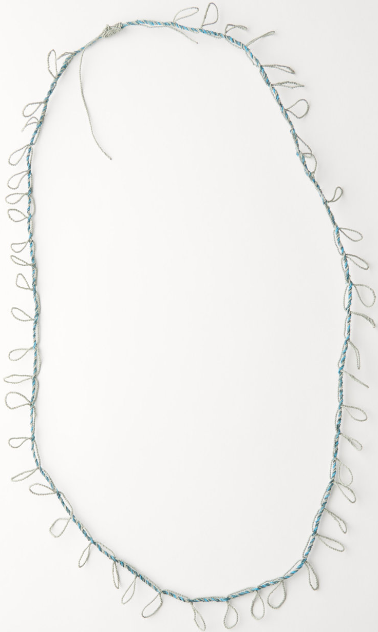
Verdant III 2022 found silage wrap, found baling twine SOLD