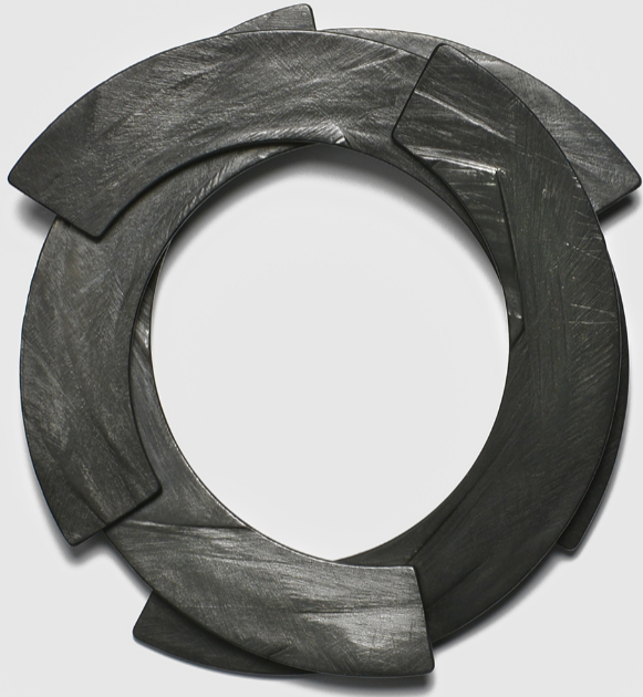
CUT 33 Brooch, 2020 Found metal objects, hand cut $1140