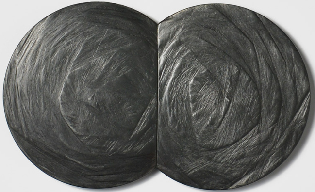
CUT 21 Brooch, 2019 Found metal objects, hand cut $930