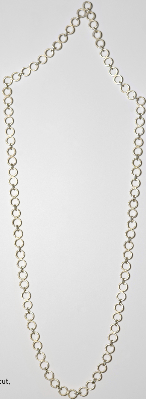
CYCLE 26 Necklace, 2024 found metal objects, hand cut, cast in silver $2320