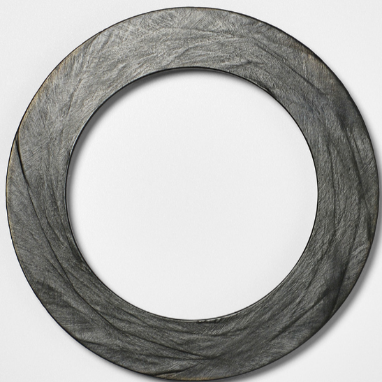
CUT 33 Brooch, 2020 Found metal objects, hand cut $990