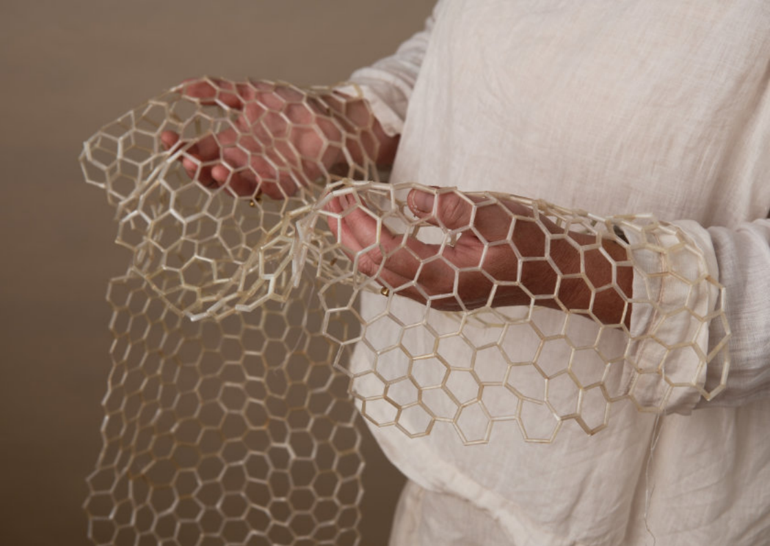
Coop Object, 2025-26 Chicken feathers, silage netting 112 x 24cm $6200