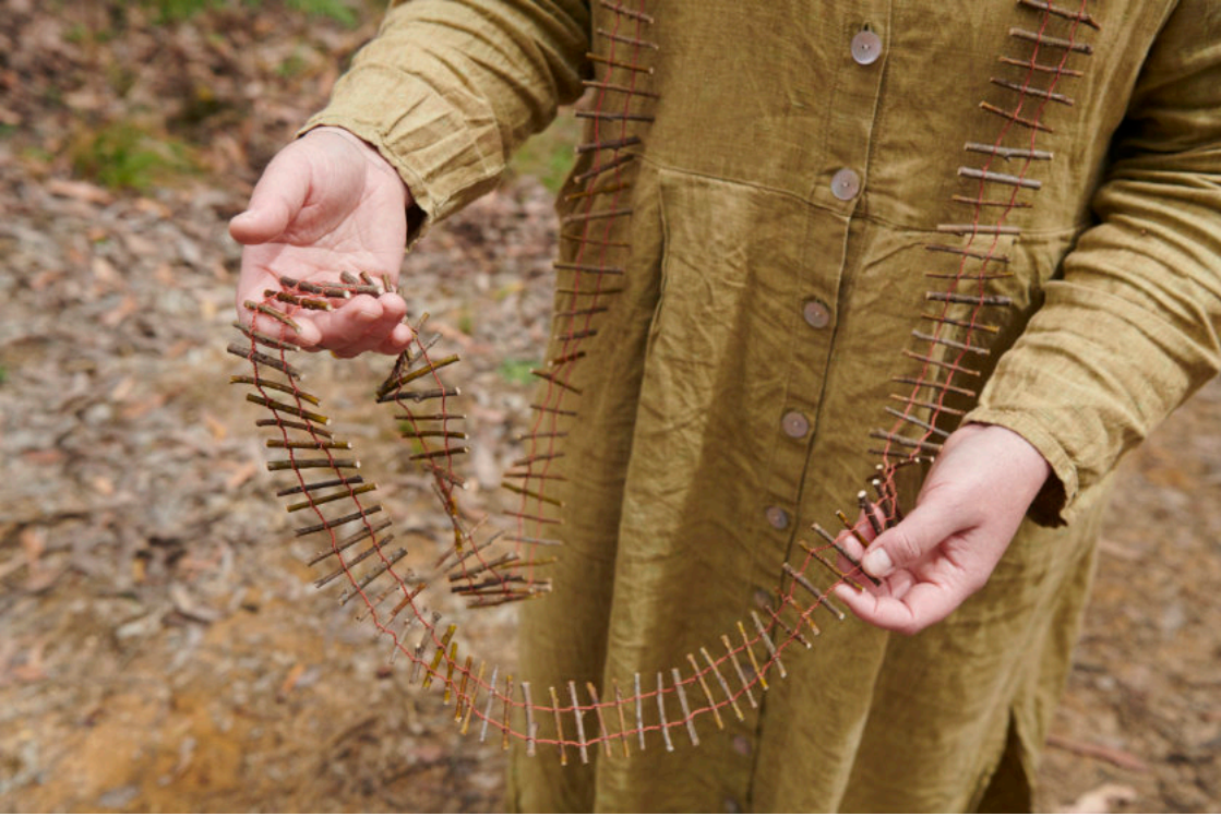
Paddock IV Necklace, 2023 Willow, baling twine 250cm long $2300