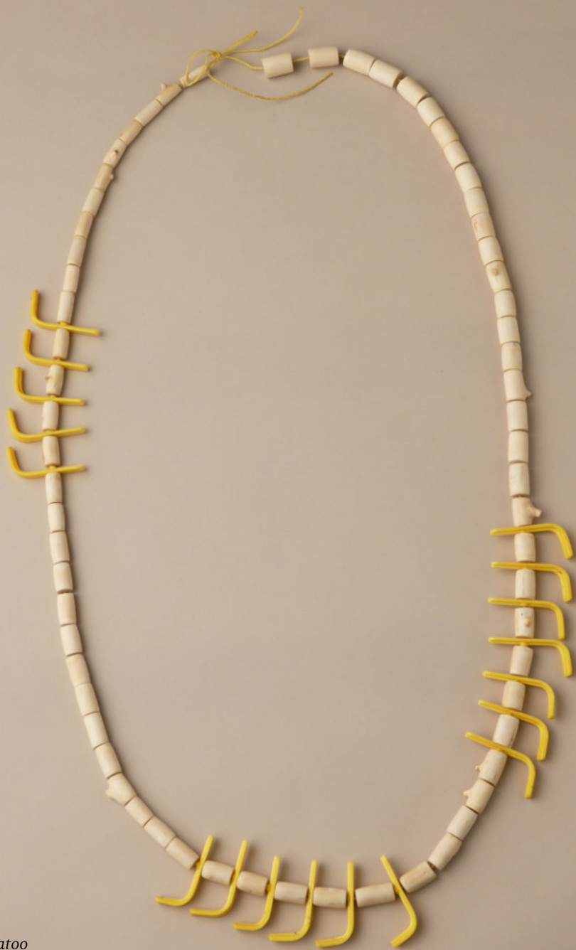
Cockatoo Necklace, 2026 Rake, willow, baling twine 180cm long, hangs to 90cm $2300