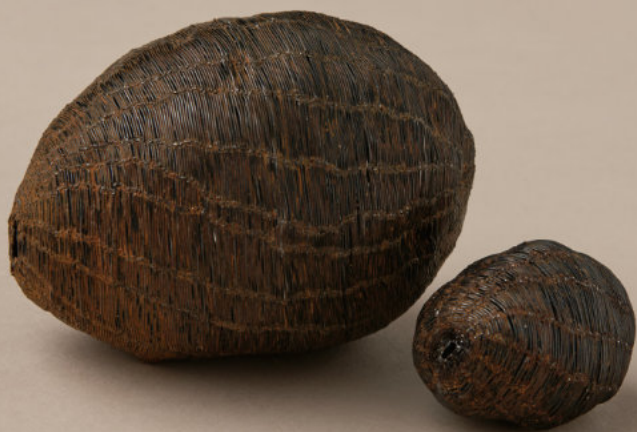
The amount of dirt my daughter and I can hold Objects, 2026 iron 10 x 8 x 8cm / 5 x 3.5 x 3.5cm $5200 (pair)