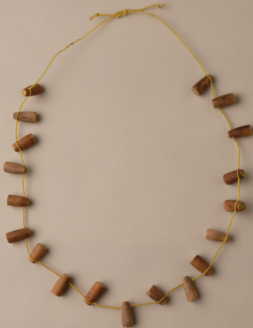
'ellow II Necklace, 2025 Wooden pegs, baling twine, paint 77cm long, hangs to 35cm $1450