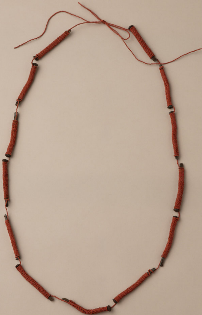
Holding on Necklace, 2026 Hand forged iron nails, baling twine 120cm long, hangs to 60cm $2200