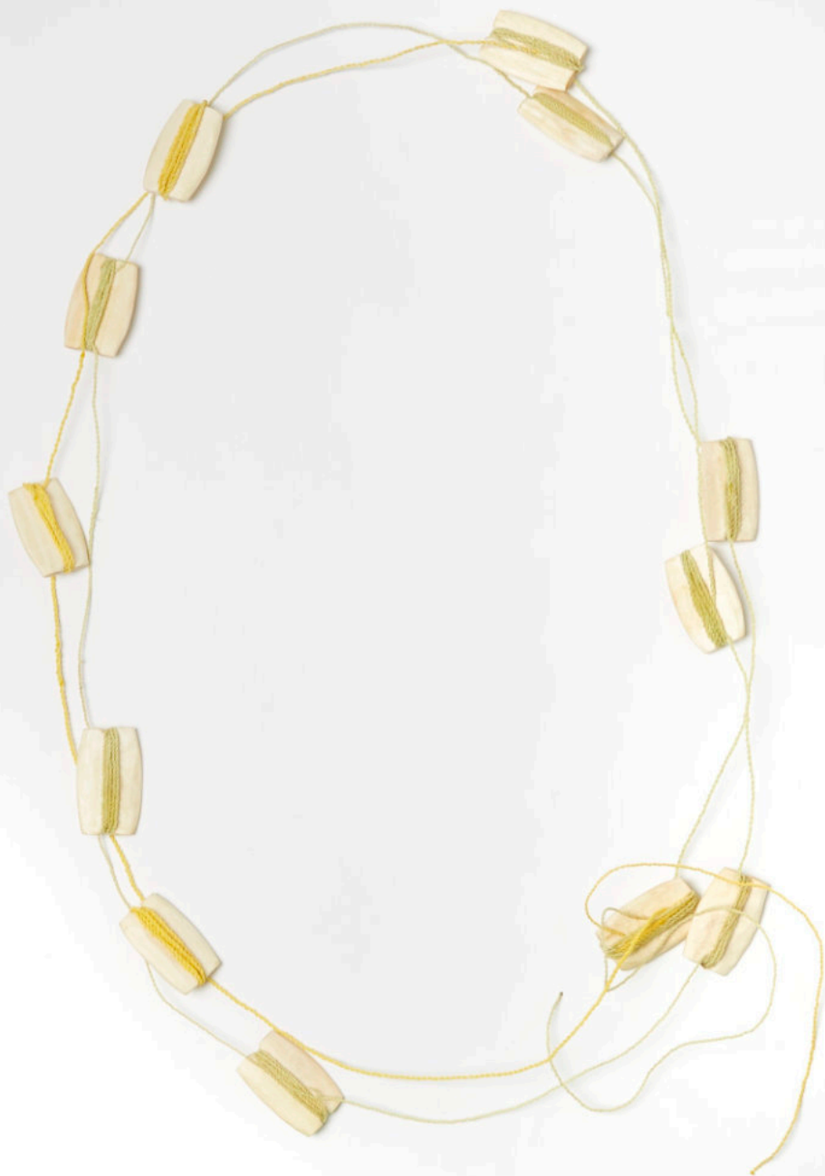
Unravelling II Necklace, 2021 Willow, baling twine 240cm long (overall) $2250