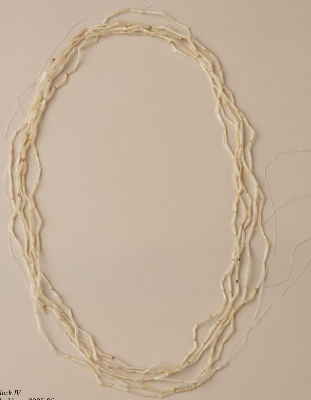
Flock IV Necklace, 2025-26 Chicken feathers, silage netting 120cm long, hangs to 62cm $1300