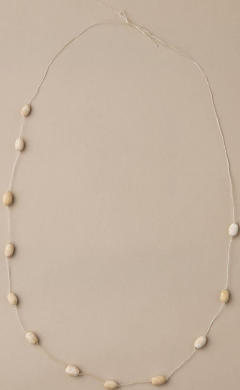
Flock V Necklace, 2026 Edition of 5 Birch, paint, silage netting 88cm long, hangs to 44cm $880