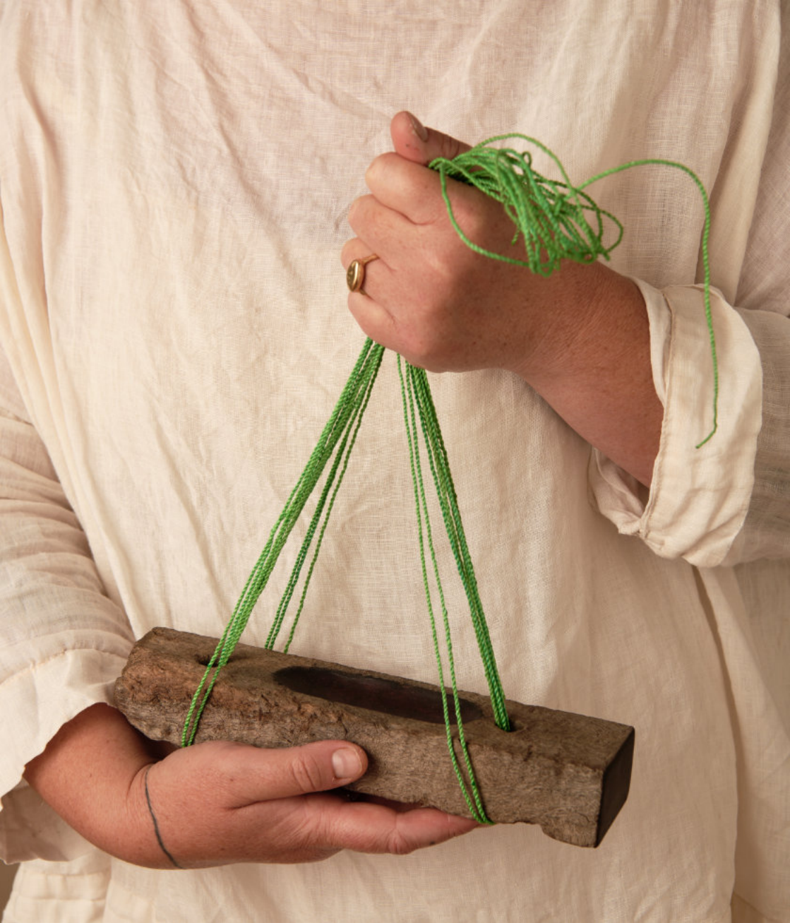
A form for a hare Necklace, 2025 River red gum fence post, baling twine 40 x 24 x 5cm $1640