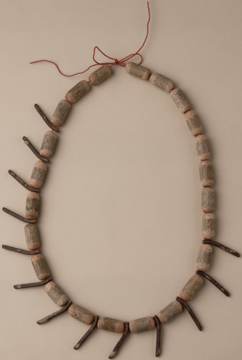
Brolga Necklace, 2025 Iron rake, baling twine, paint 120cm long, hangs to 61cm $3400